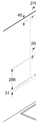
Measurements in mm

If a back panel is used the design of the appliance must be considered.