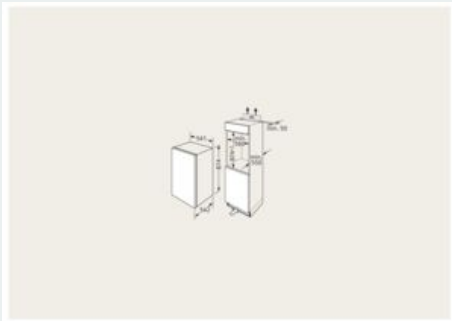
measurements in mm Recommended gap dimensions for flat hinges