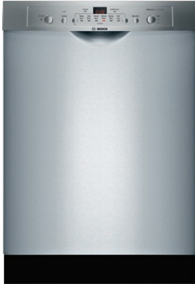
SHE3AR75UC Stainless Steel