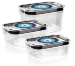
Tritan™ vacuum container 0.91 & 1.21 & 1.71 MSZV0FC3