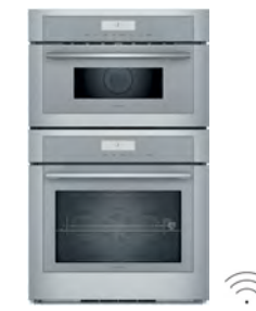
30-Inch Double with Speed Oven