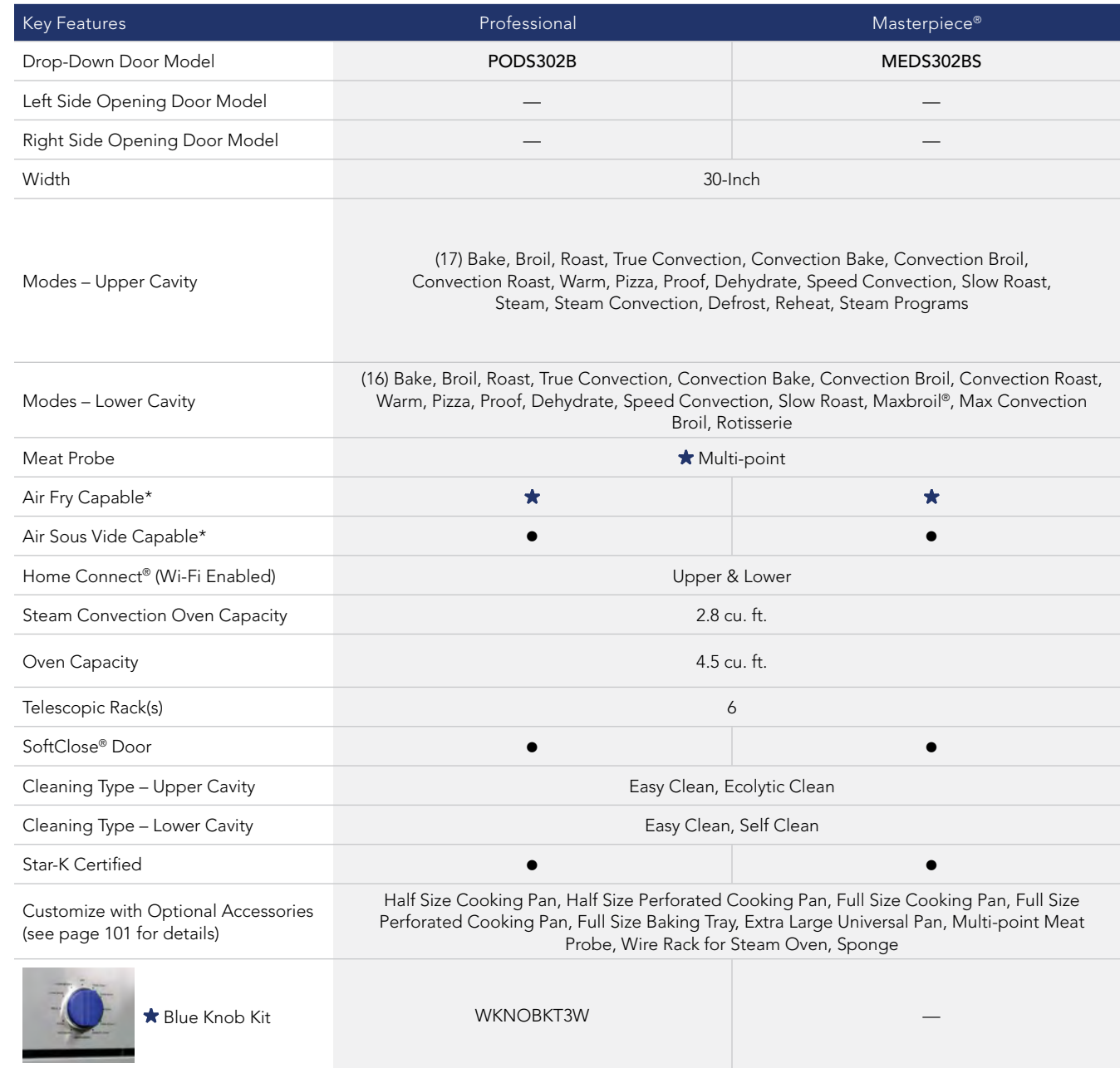
30-Inch Double with Steam Convection

*Air fry and air sous vide is available on select models via Wi-Fi, and is available in the primary cavity only. Visit Thermador.com for details.