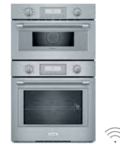
30-Inch Double with Speed Oven