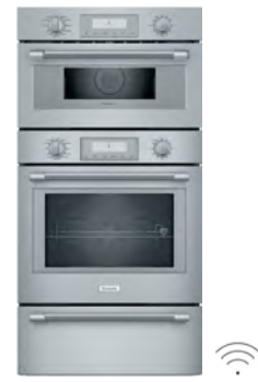
30-Inch Triple with Speed Oven & Warming Drawer