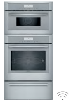
30-Inch Triple with Speed Oven & Warming Drawer