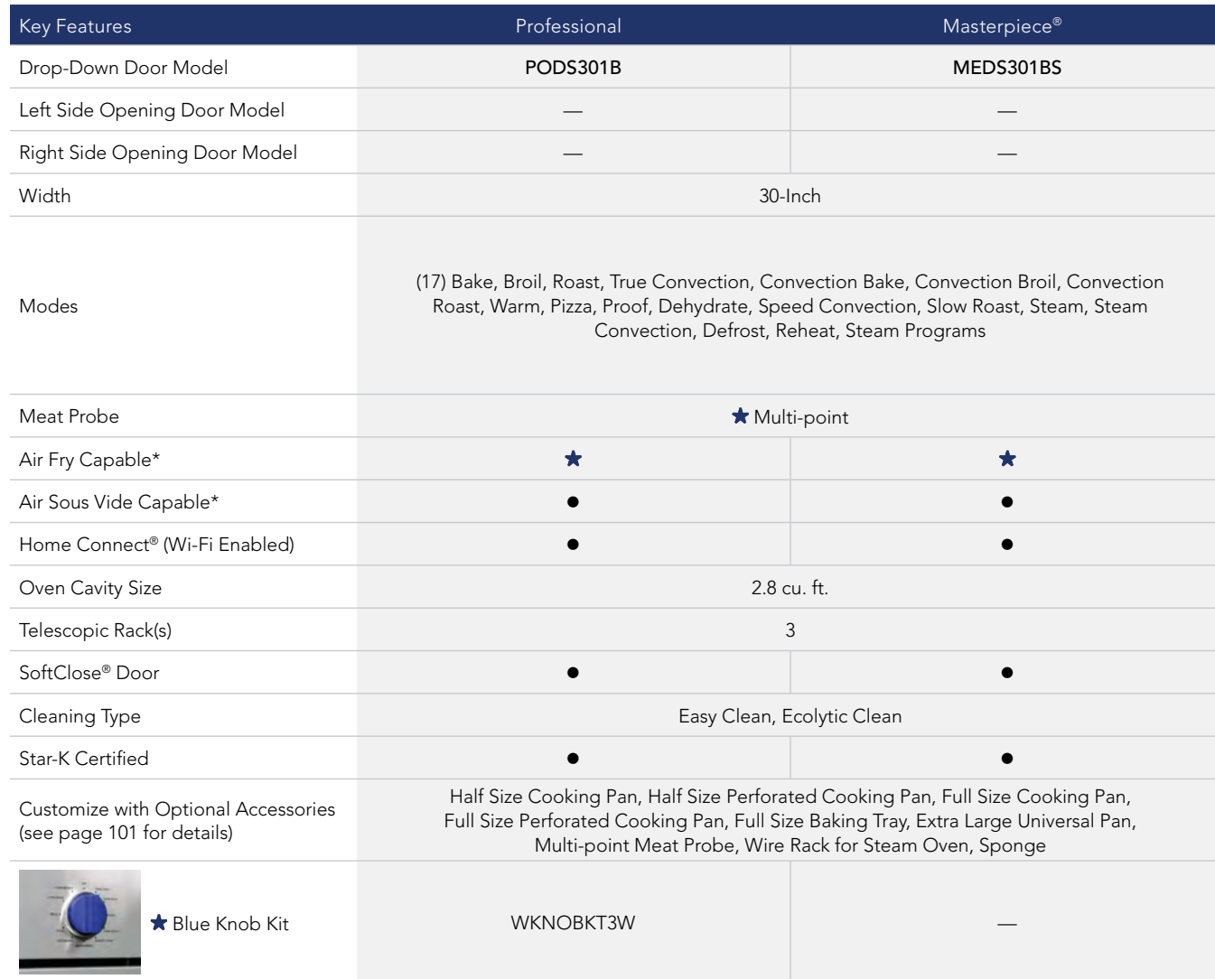
30-Inch Steam and Convection (Non-Plumbed)