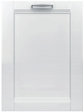
SHV9PCM3N Custom Panel

Benchmark™ Series – Custom Panel SHV9PCM3N