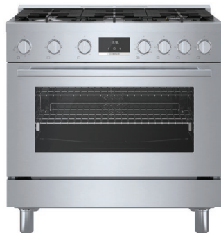
HGS8655UC Stainless Steel